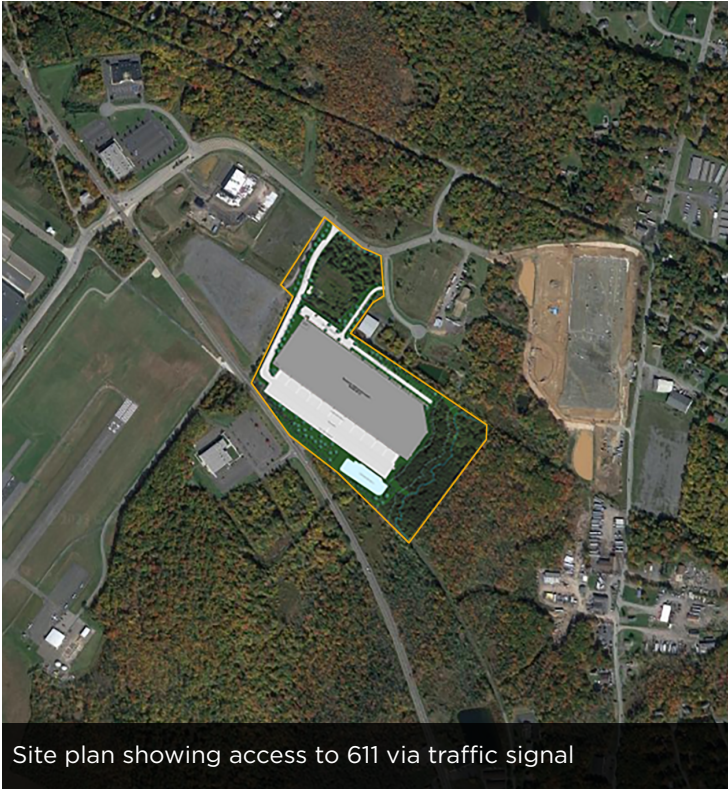
Site plan showing access to 611 via traffic signal