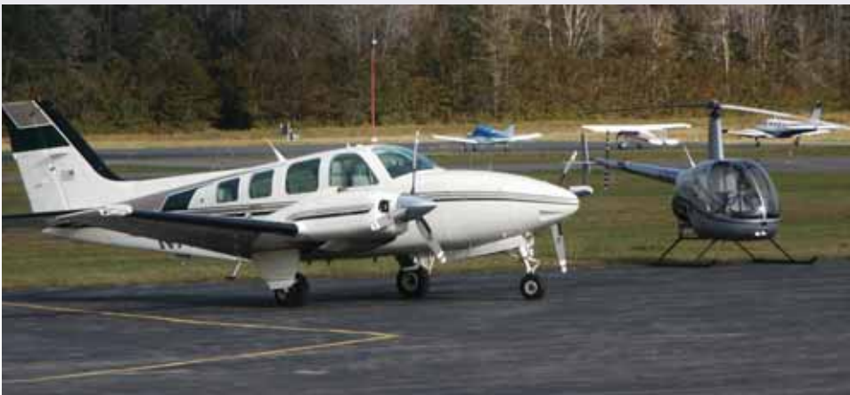
POCONO AIR CENTER OFFERS HELICOPTER AND FIXED WING CHARTER SERVICES. PISTON-POWERED AND TURBINE-POWERED PLANES ARE BOTH AVAILABLE.

For more information, visit www.PoconoAirCenter.com